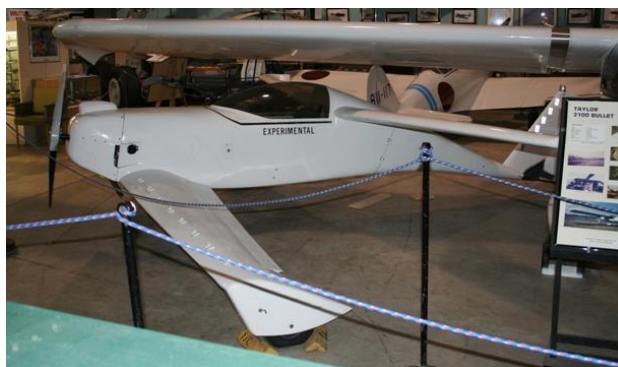
Our Quickie One

Powered by a 22 HP Onan air-cooled 2-cylinder "flathead" gas engine, the lightweight Quickie will cruise at about 130 mph and requires very little runway length to get airborne. It is a twin-wing design inspired by the "X-fighters" in the original Star Wars movie. The "Q1" is a "taildragger" with very unusual landing gear. The main wheels are located at the tips of the lower/forward wing... 17 feet apart. The tail wheel is attached to the underside of the tailfin/rudder assembly. This unconventional gear creates challenges for novice pilots as the craft has a pronounced affinity for ground looping if the main wheels do not touch down simultaneously. When the Quickie One ground loops, the prop gets "dinged" and the tail wheel makes an unceremonious exit from the aircraft to the left or right.