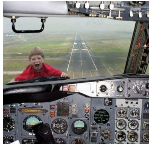
Dealing with the unruly kid in seat #15B