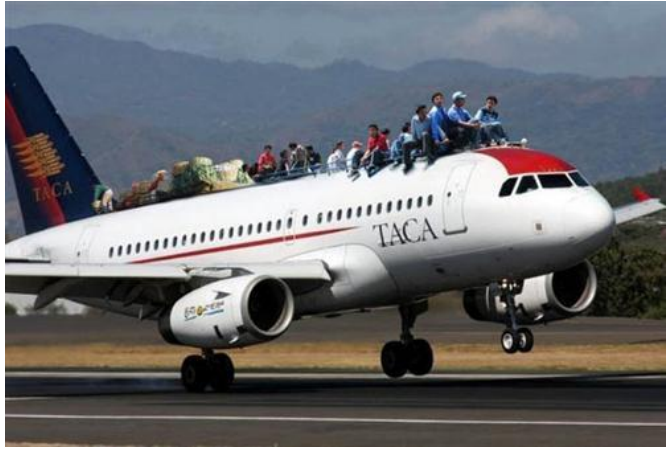
Irrefutable evidence of airline overbooking