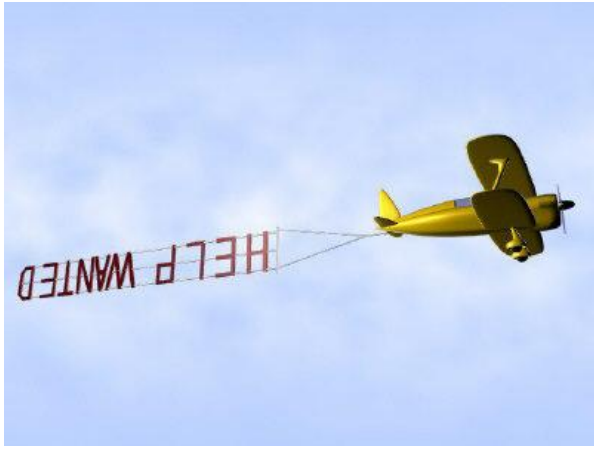
Truth in Advertising