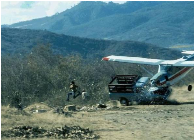
Extreme Border Enforcement

"Never run out of airspeed, altitude and ideas at the same time"